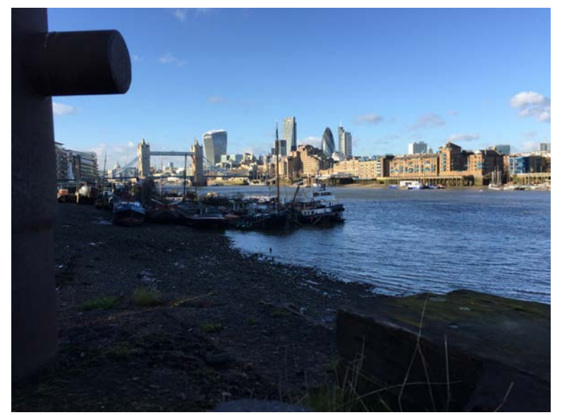
A view of the Thames near Rotherhithe

At Rotherhithe, walk up to Brunel Museum, a MUST to visit.