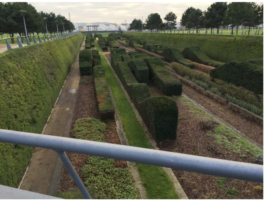
Thames Barrier Park, a very innovative garden.

Once arrived, take the Store Road and then Factory Road, North Woolwich Road until you arrive at the Thames Barrier Park.