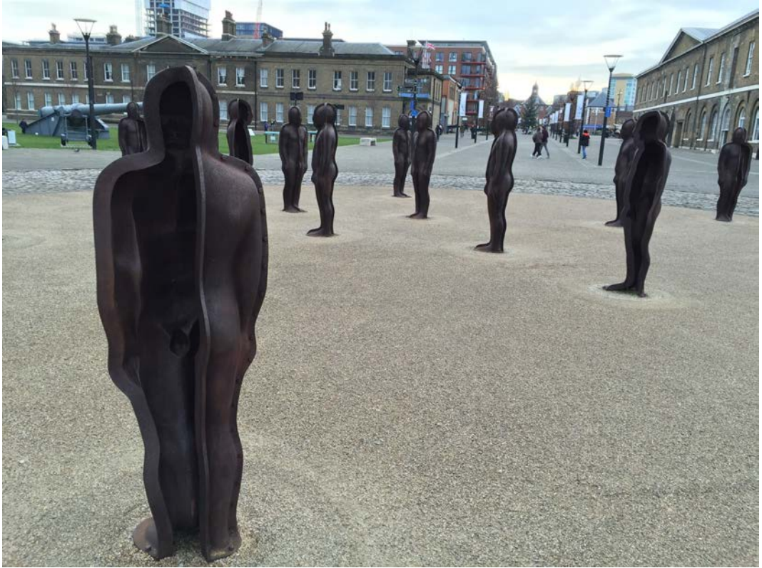
New sculptures in iron, Arsenal of Woolwich