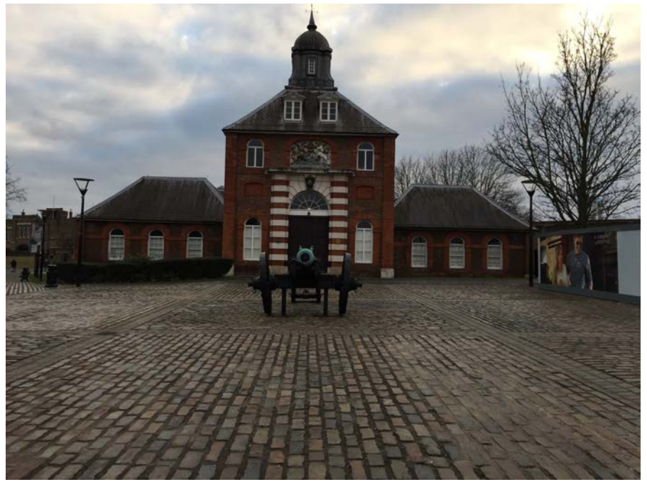
The main entrance of the old Arsenal of Woolwich

Ones here, visit the Arsenal. It is very interesting and well refurbished.