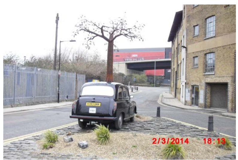
A tree planted inside a taxi cab, in East docks

The old harbor is a squalid zone, if you look with traditional eyes, but there are also new inspirations to eyes. Spend some time here.