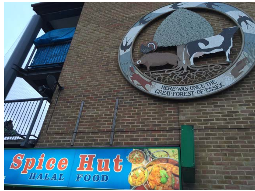
"Here was once the Great Forest of Essex", now Leyton