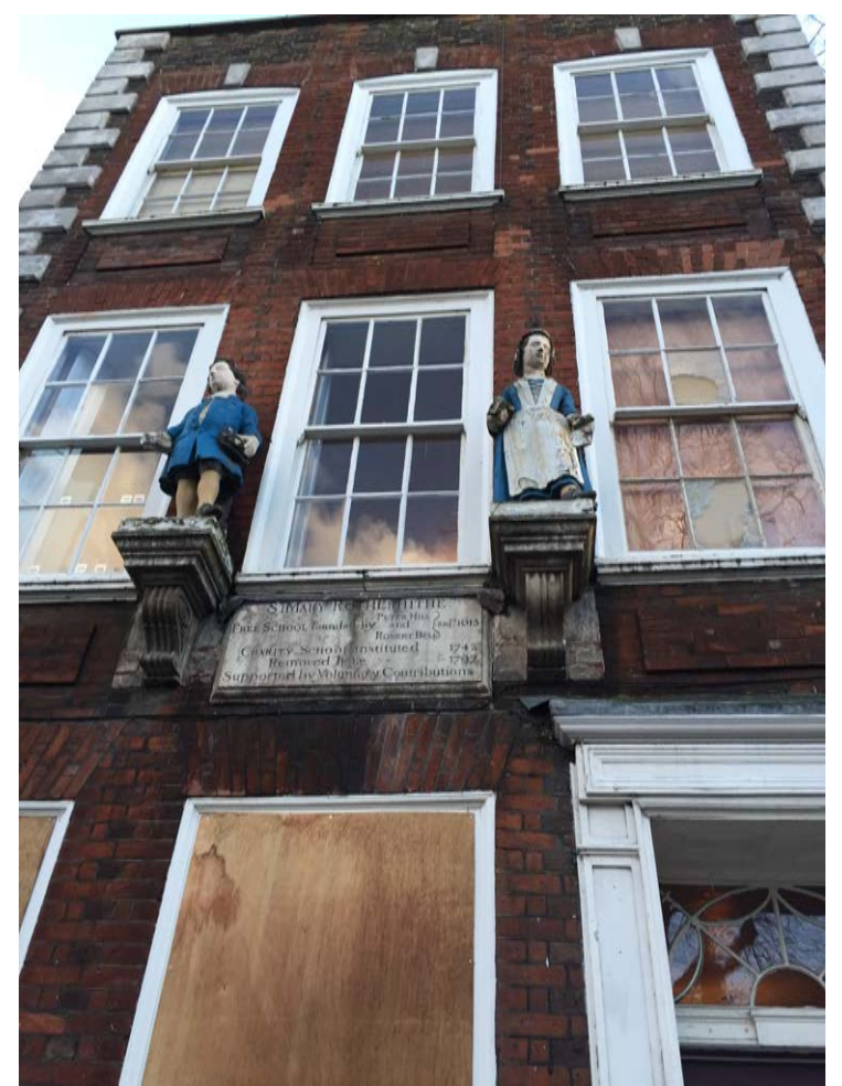
A bluecoat school in Rotherhithe, where girls also were admitted

The Blue Schools have existed for centuries.