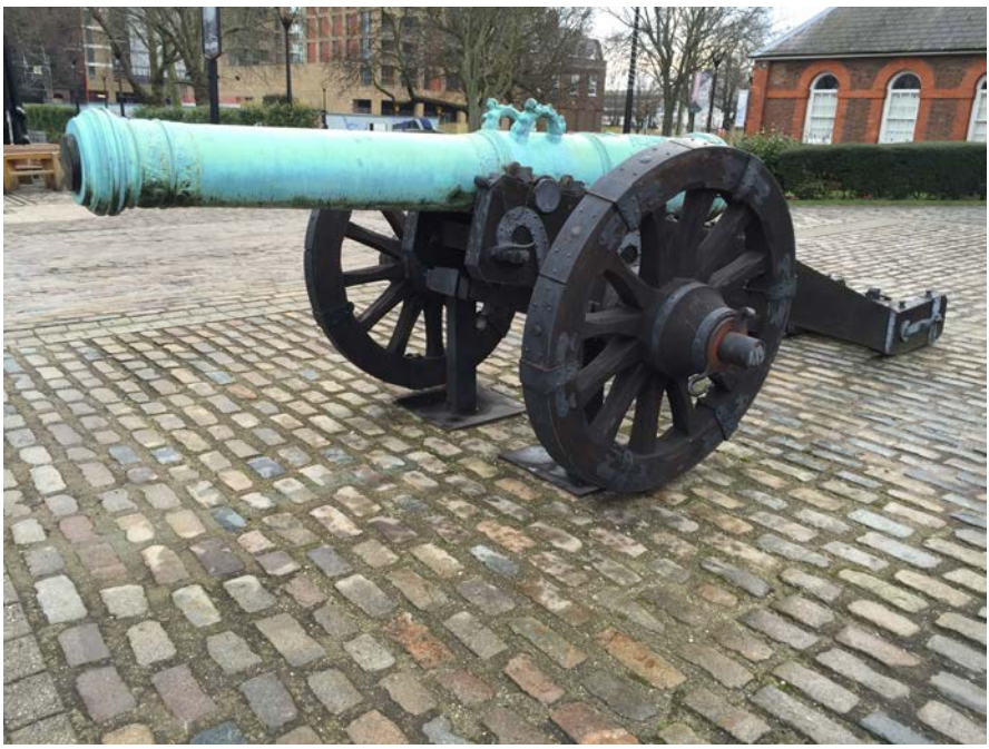
This monster has surely killed many...