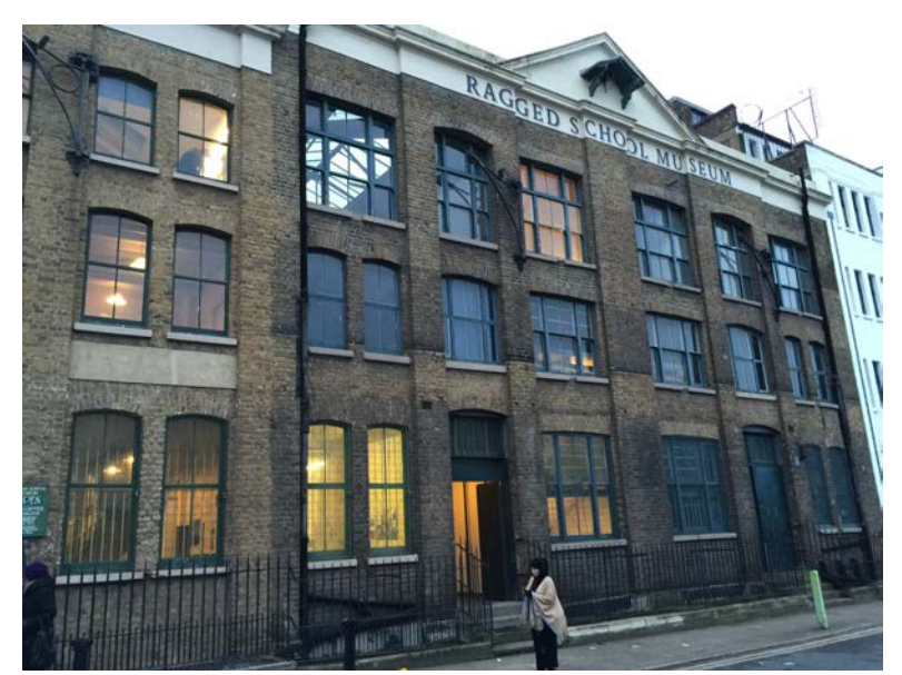
Entrance of the School

The name Mile End probably derives from the pest-time, where the deads were loaded upon a carriage and sent out of London for one mile, there they ended in mass burial places.