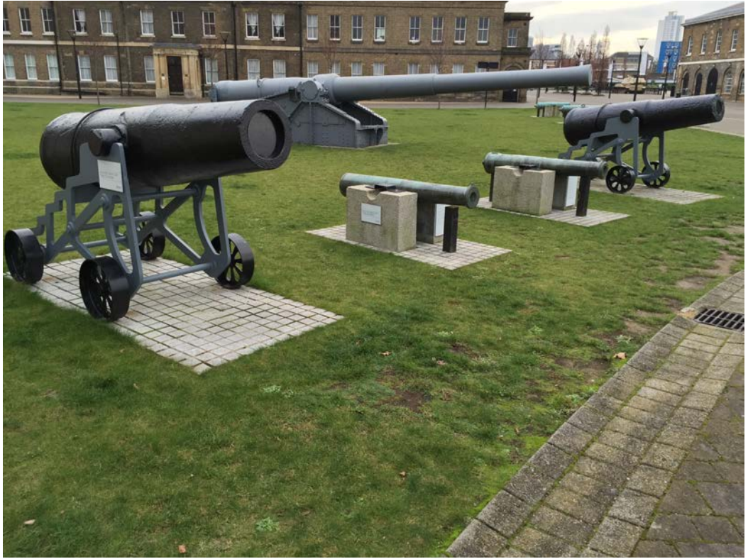
Canons for every taste...

After the visit of Woolwich, go to the Thames.