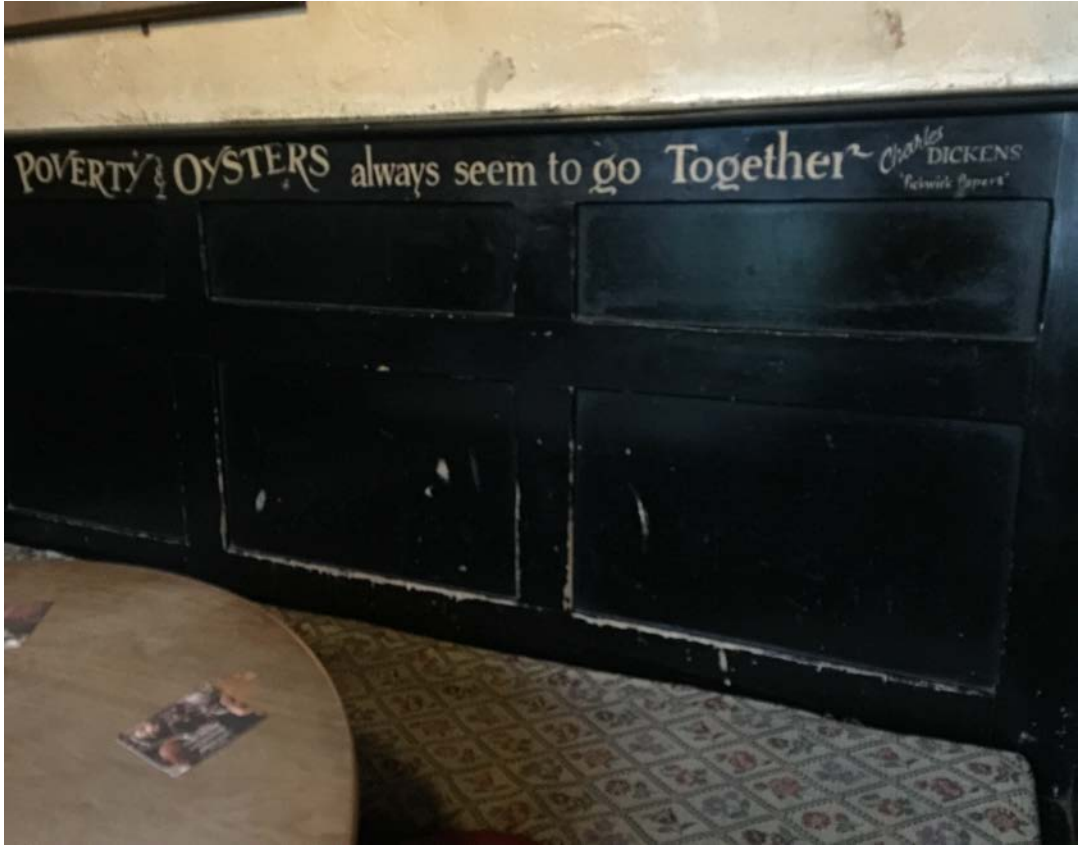
Pub in Rotherhithe: "Poverty and Oysters always seem to go Together", Charles Dickens